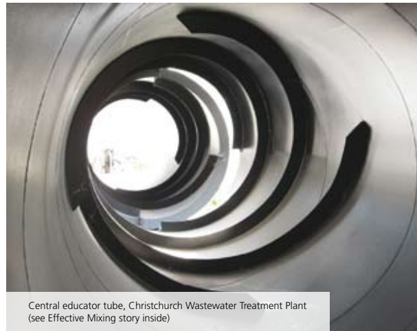
Central educator tube, Christchurch Wastewater Treatment Plant (see Effective Mixing story inside)

We hope that you will enjoy the articles featured in this edition of Watermark and look forward to your company at the conference!