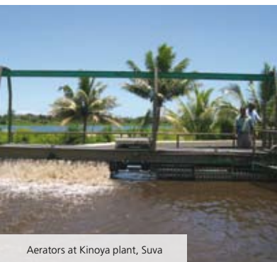
Aerators at Kinoya plant, Suva