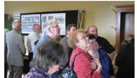
▲ Members of the public view concept options at the Open Day

“The DCC felt the main advantage of an evidence-based approach would be to ensure that debate about the delivery of benefits centres around what is actually happening on the street as what is being