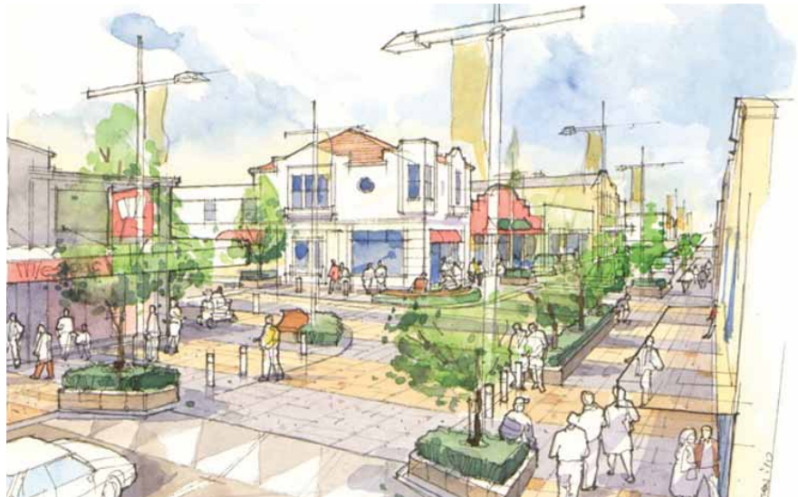
▲ A concept design for King Edward Street, Dunedin, New Zealand

We used this research to develop the design options. One of the actions identified is to provide footpaths that match pedestrian ‘desire lines’. This also increases safety by making pedestrians more visible to drivers before they cross.