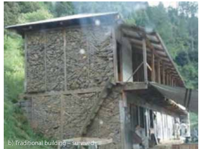
Figure 3: Comparing performance of modern and traditional construction in the 2005 Kashmir earthquake