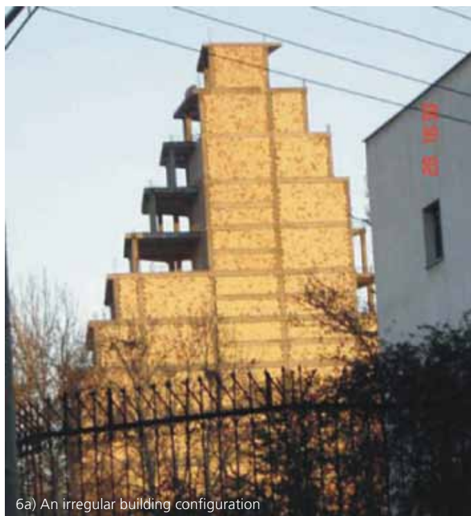
6a) An irregular building configuration

In NZ, there are examples of how not abiding by the law has become an incentive, and those abiding by law are left in the cold. Many unreinforced masonry buildings that were previously strengthened to two-thirds of NZSS 1900, Chapter 8 (NZSI, 1965) as required by previous legislation and regulations are being deemed earthquake prone buildings in Wellington. Owners of these buildings had spent significant sums to strengthen their buildings to comply with previous legislation. It is disappointing for them to know that the building which was strengthened just a few years before is again an earthquake prone building and they have to spend yet again a significant amount of money to revoke this status. It has effectively become an incentive for those who did not abide by the law at that time.