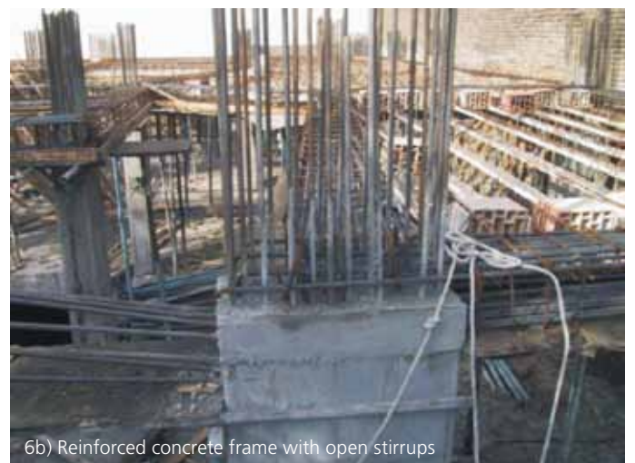
6b) Reinforced concrete frame with open stirrups

One of the missing pieces of jigsaw puzzle is who is responsible for assuring the safety of a building in an earthquake and, if it is not safe, who is responsible for making the building owner aware? Discussions with building engineers show a variety of attitudes. Some would say that the building complies with building standards, but would not say whether the building is safe or not because of various issues. In this scenario, how can a layman (from a safety point of view) know whether his building is safe or not?