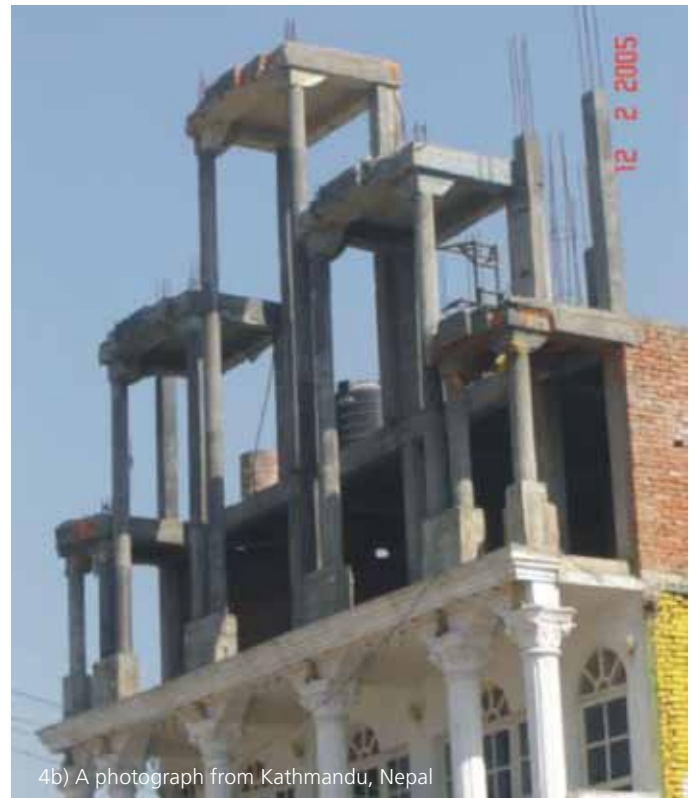
4b) A photograph from Kathmandu, Nepal

Increased affordability and education also do not mean increased seismic safety. In an economic boom, building regulations are quietly brushed away (Hodson, 2000). The losses to middle-class housing in Ahmedabad in the 2001 Bhuj (India) earthquake highlighted how increased affluence resulted in increased luxury rather than in safer buildings. Fig 4a presents a picture of a collapsed building, where people constructed a swimming pool on top of the existing building rather than strengthening it. Fig 4b shows a photograph of unusual structures constructed on top of a four-storey building in Kathmandu, Nepal. The owner opted to construct these vulnerable structures on top of the building rather than investing in a safer building.