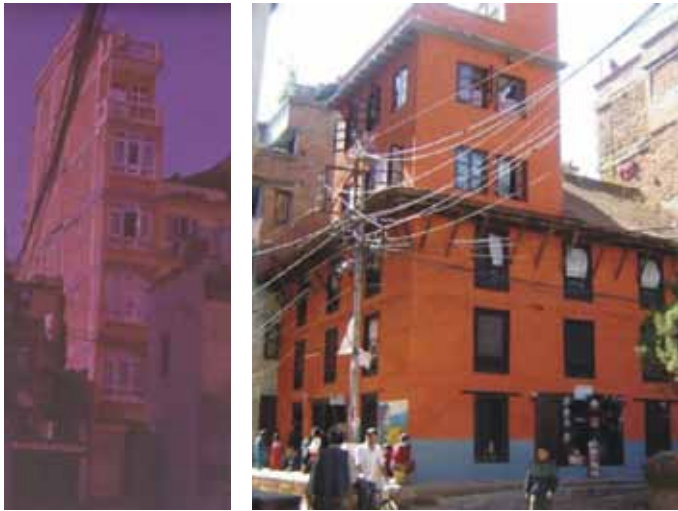
Figure 5: Added vulnerability in Kathmandu due to social norms and customs

In NZ, there are examples of how not abiding by the law has become an incentive, and those abiding by law are left in the cold. Many unreinforced masonry buildings that were previously strengthened to two-thirds of NZSS 1900, Chapter 8 (NZSI, 1965) as required by previous legislation and regulations are being deemed earthquake prone buildings in Wellington. Owners of these buildings had spent significant sums to strengthen their buildings to comply with previous legislation. It is disappointing for them to know that the building which was strengthened just a few years before is again an earthquake prone building and they have to spend yet again a significant amount of money to revoke this status. It has effectively become an incentive for those who did not abide by the law at that time.