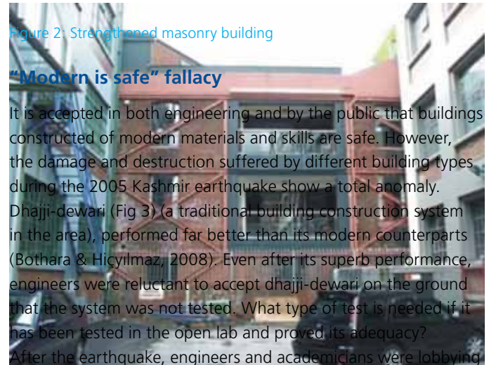
Figure 2: Strengthened masonry building

Interestingly, many of the unreinforced masonry buildings in Wellington are strengthened with steel structures (Fig 2). This technique is easy and fast to implement. However, it would be interesting to observe the progressive damage under an earthquake due to incompatible systems: flexible steel and rigid masonry structures. Due to the high flexibility of the steel structure, by the time the steel structure starts carrying load, the masonry will probably have suffered significant damage and lost most of its strength and stiffness.