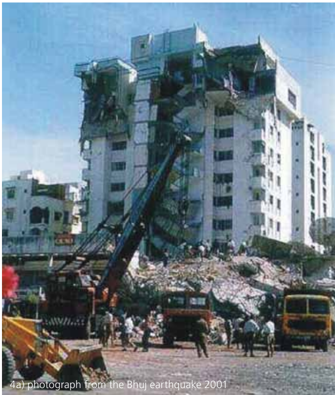
4a) photograph from the Bhuj earthquake 2001